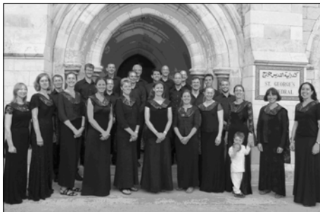
Ishirini at St George's Cathedral, Jerusalem

At the end of August I was lucky enough to join a tour with my choir, Ishirini , to the Holy Land. We joined up with Palestinian Christian choirs in Nazareth and Bethlehem and took part in a massed-choir finale to the Palestinian Choral Festival in Ramallah. It was a privilege to sing a mass in the Basilica of the Annunciation, Nazareth, and evensong in St George's Anglican Cathedral, Jerusalem. We swam in the Sea of Galilee and walked on the beautiful Mount of Olives.