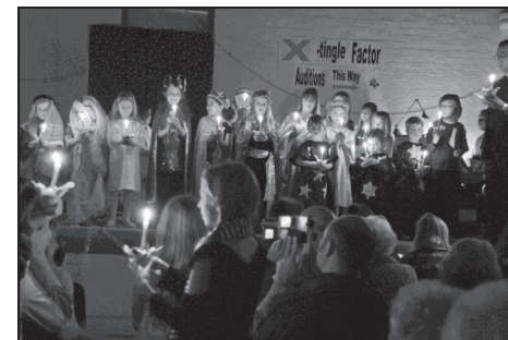
The Christingle candlelit singing of 'Away in a manger'